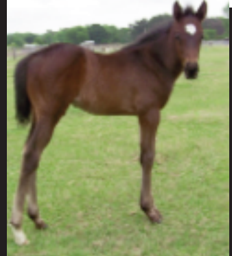
Colt by Portobello Road - Robin's N Beau's Dan Bearden, breeder