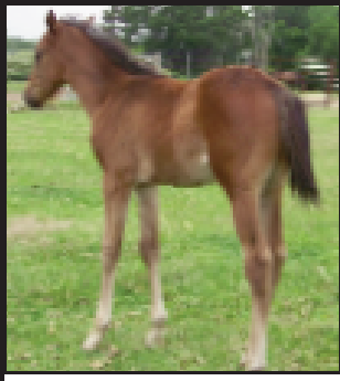
Colt by Portobello Road - Prostar Randy Hall, breeder