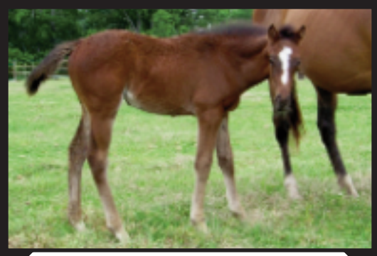
Filly by Portobello Road - Alleged Diva Anderson Farms, Breeder