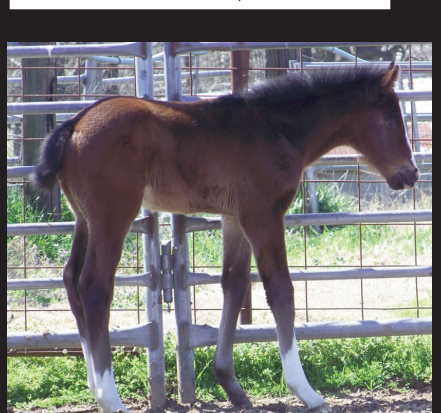
Orphan Foal - DOING GREAT! Colt by Portobello Road - Eastern Memory William T Reed, Breeder