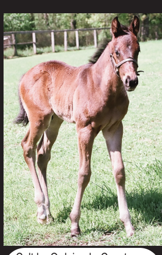
Colt by Ordained - Constance StarfishStable, LLC, breeder