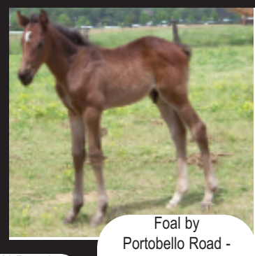
Portobello Road -Festival Dress Anderson Farms, breeders