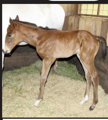
NEW 9 HOUR OLD COLT 5/6/13 by Spotsgone - Everleaner Penny Fires and Val Yagos, breeders

(2013 foal pictures continued on page 12)