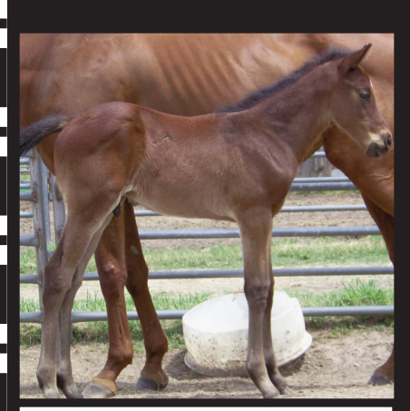
Foal by Portobello Road - Fetch You Back Saysomethin Racing, breeder