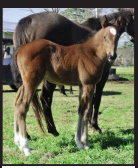
Colt by First Dude - Mount Gay McDowell Farm, Breeder 1/31/13