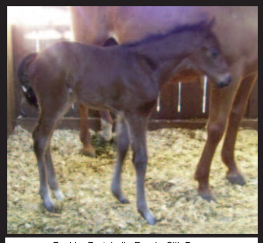
Foal by Portobello Road - Silk Dress Anderson Farms, Breeder 2/3/13