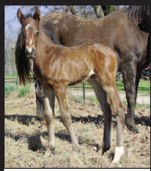
FULL BROTHER TO TRICKY SUSPECT Colt by Primary Suspect - Great Trick Eugenia Thompson & Joe Benight, Breeders 2/11/13