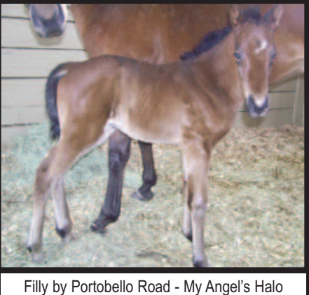
Filly by Portobello Road - My Angel's Halo Anderson Farms, breeder/owner 2-9-13