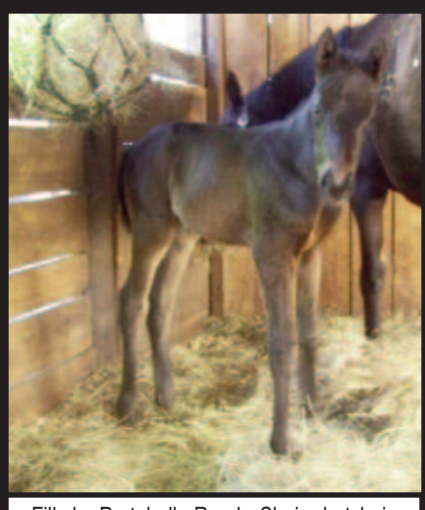
Filly by Portobello Road - Sheiswhatsheis Pat Jackson, Breeder 2/4/13