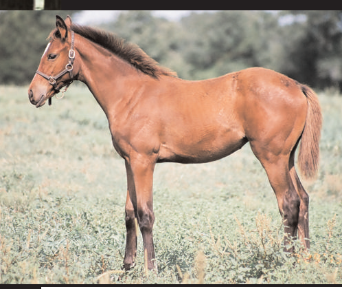
Twice Ordained Filly, by Ordained - Twice As Wiser Starfish Stable, LLC, breeder/owner