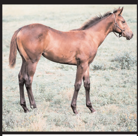
Ordaina Filly by Ordained - Only Starfish Stable, LLC, breeder/owner