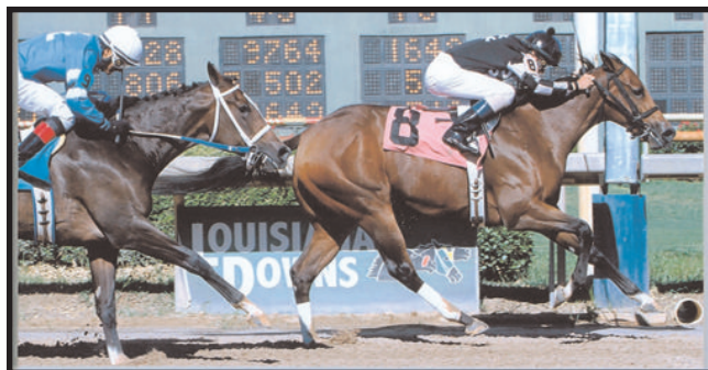
By Awesome Again - Belle's Appeal, by Valid Appeal Jon L Starr, breeder - Flurry Racing Stables, LLC owner

LITTLE MISS FLURRY broke alertly, cleared to the inside, rated up the backstretch, held sway in the drive under steady handling. QUESTLIE pressured the winner from the outside throughout, proved stubborn to the end. PRETTY SUSPECT raced off the pace and the inside, set down for the drive, drifted stretch, no match for the top two in the late going. IVY JO lacked speed, angled out midstretch, improved slightly while not having enough in the final strides for the show. OPPOSITE DAY back off the pace for a half, dropped to the inside nearing midstretch, displayed a modest amount of late interest up the rail. HUGGINS AND KISSIN chased the top two for the four furlongs and tired. SEEING DESTINY off slowly, moved out while trailing, wide, no rally. AUNT NEANIE always outrun.