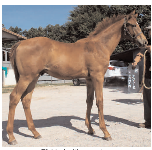
2015 Colt by Street Boss - Flamin Josie Starfish Stable, LLC, Owner/Breeder