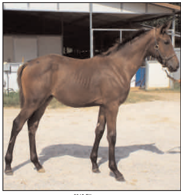
2015 Filly by Ordained - Twice As Wise Starfish Stable, LLC, Owner/Breeder