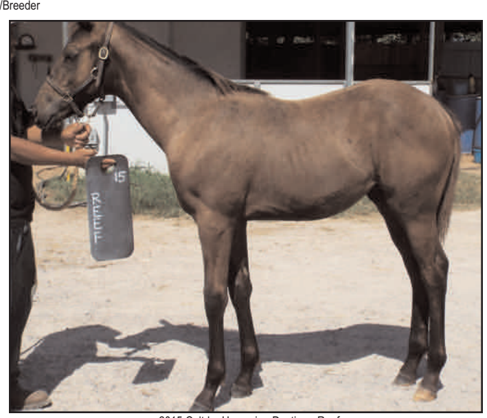
2015 Colt by Hamazing Destiny - Reef Starfish Stable, LLC, Owner/Breeder