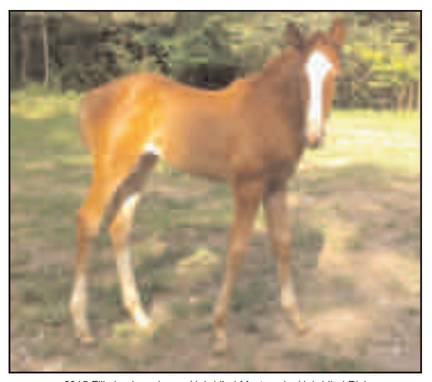
2015 Filly by Jonesboro - Unbridled Mystery, by Unbridled Risk Delia McBride, Owner/Breeder