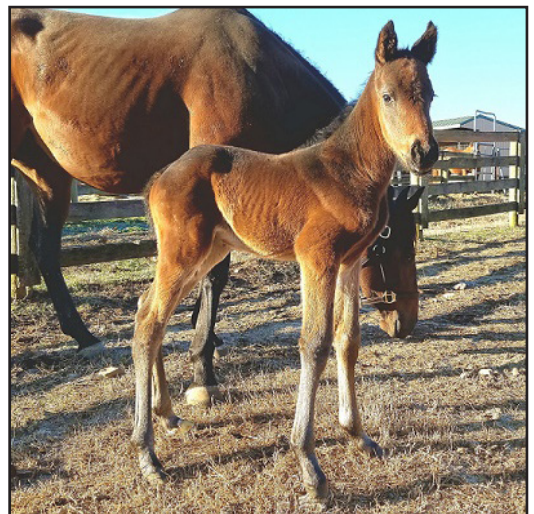
Colt by Street Strategy - Southern Affair Strickland Racing & Breeding, LLC, breeder