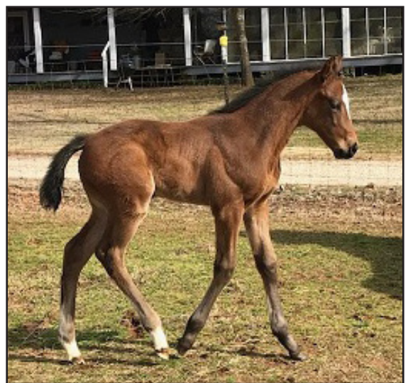
Filly by Even the Score - Syriana McDowell Farms, breeder