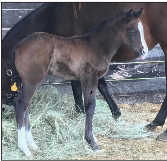
Filly by Too Much Bling - Patchofbadweather Flurry Racing Stable, breeder