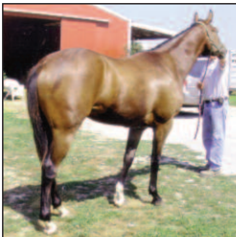
Fatherscountrygirl - 2010 Dark Bay Filly by Father Steve - Spanish Lass (Winner of $75,000) 30+ days riding $3,500

ALSO 2 yearling fillies by Hesabull and 1 yearling filly by Dove Hunt