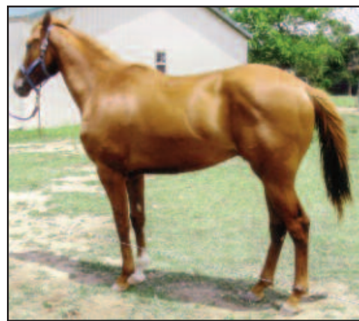
Romeo Romeo - 2010 Chestnut. Gelding by Proudest Romeo - Rain River (Stakes Place/Winner $62,000) 60 days riding $3,500

CONTACT: Eugene Branum Cell (501) 467-1829 Home (931) 649-2910