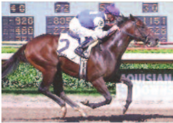
Winner by 2 3/4 lengths in 1:11.4