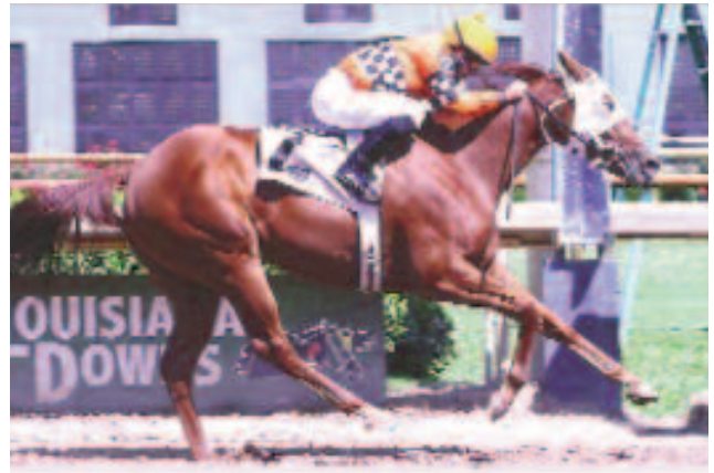
Winner by 7 1/4 lengths in 1:10.3