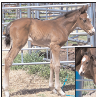
4/6/14 filly by Street Hero - Shore Breeze Hero Eugenia Thompson, breeder