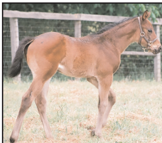
2014 filly by Ordained - Only Starfish Stables, breeder