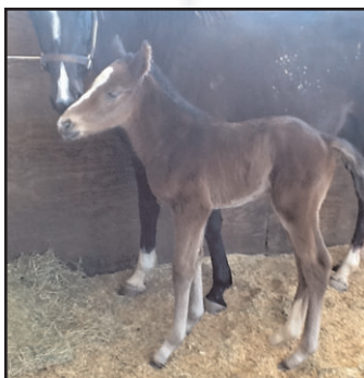
2/21/14 colt by Regal Ransom - Cotton Club Ballet, by Street Cry