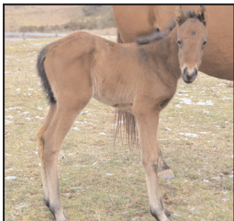
3/3/14 foal by Spotsgone -Babette's Belle, by Richter Scale