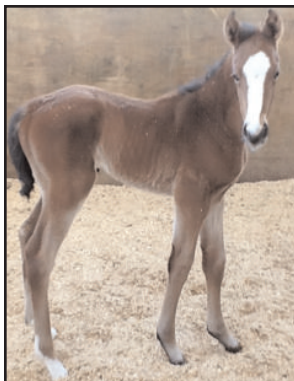
3/5/14 foal by Unbridled's Risk -Asticou, by A P Indy