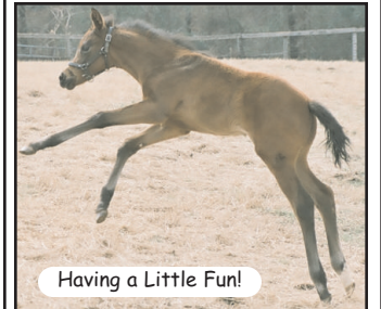
Having a Little Fun!