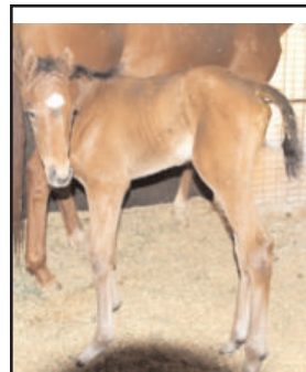
3/12/14 foal by Spotsgone -Angel in Command by Deputy Commander