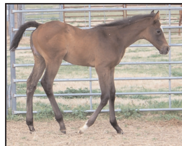
2/21/14 filly by Phantom Light- Unbridled's Torch