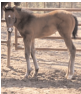
1/23/14 filly by Archarcharch -Missy Lou, by Yonaguska