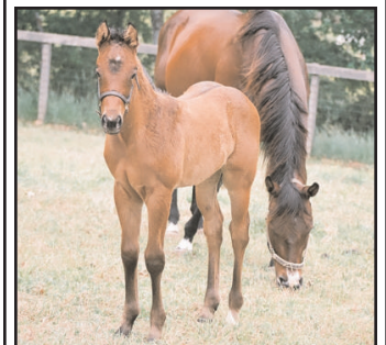
2014 filly by Macho Rocket - Impetuous Molly Sanders Brothers, breeder