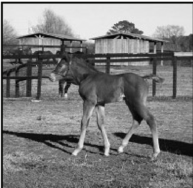
Chestnut Filly Foaled 1/14/17 By ICON IKE out of TIPPING POINT Jim Matheney, Breeder/Owner