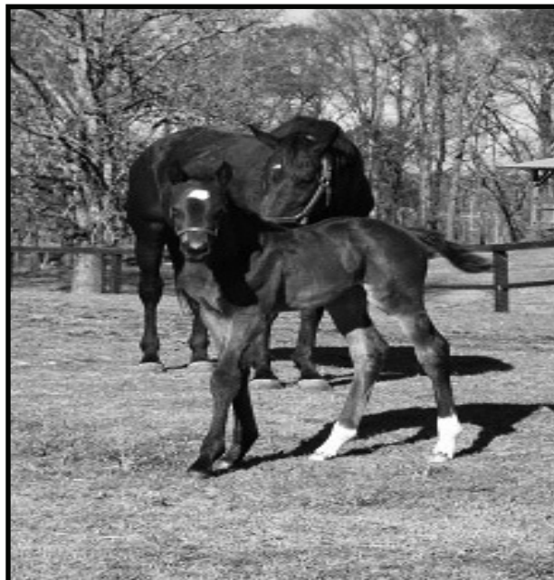
FIRST FOAL BY CYBER SECRET!!! Bay Filly Foaled 1/10/17 By CYBER SECRET out of YOO HOO TOO Starfish Stable LLC & Tom Mueller, Breeder/

Email your 2017 foal pictures to atbha@att.net ... foal pictures will be published in the upcoming issue of The ATBHA News, space allowing. Please include with each picture the sex, sire, dam and breeder's names. The date of foaling and another one line phrase can be included and will be printed if space is sufficient