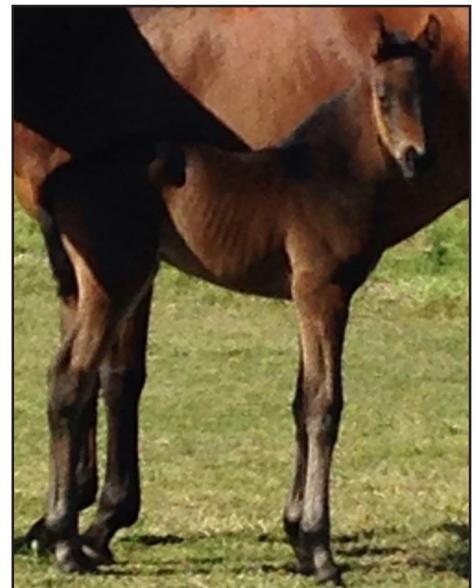
Filly by Mo For the Money - My Angel's Halo Anderson Farms, breeder/owner