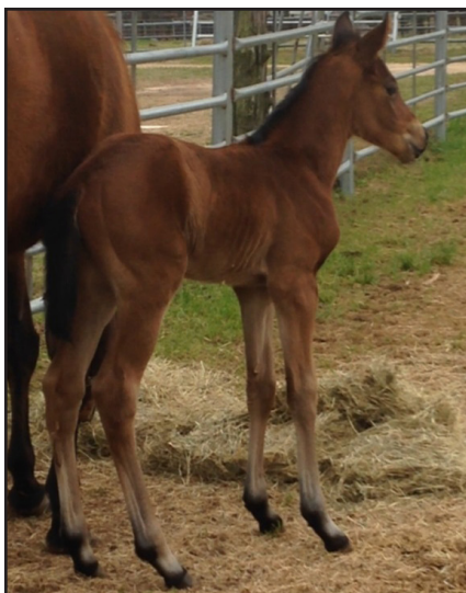
Filly by Mo For the Money - Winning with Style Anderson Farms, breeder/owner