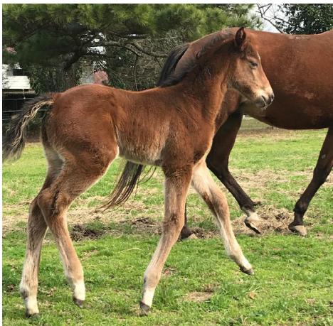
Filly by Orb - Unholy Night Kirk McDowell, breeder