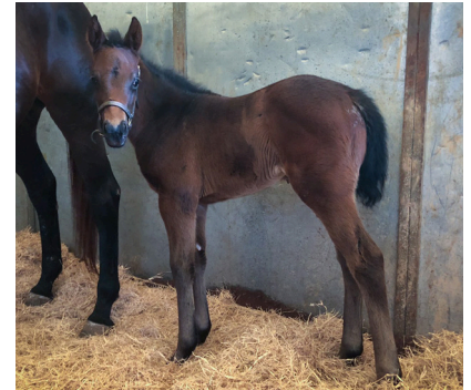
16 day old filly by Hamazing Destiny - Yahoo Too foaled 1/18/20 at Starfish Stable