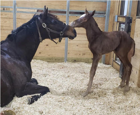
Filly by Eagle - Paddle Out Foaled 2/4/20 at Cedar Run Farm