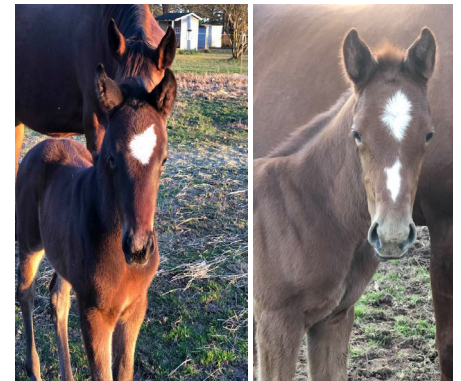
Sweet Faces Hearts & Diamonds???