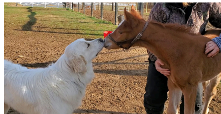
MAKING FRIENDS AT CEDAR RUN FARM!