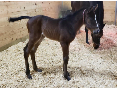
Filly by Too Much Bling - Fast Find Foaled 1/29/20 at Cedar Run Farm