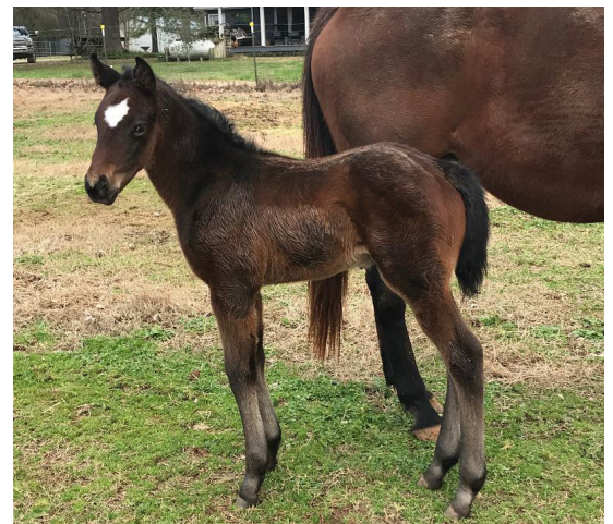
Colt by Midnight Lute - Kombat Lake, by Meadowlake. McDowell Farm, breeder