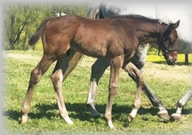
Ordained - Zonly, by Zanjero Bay Colt Starfish Stable, LLC