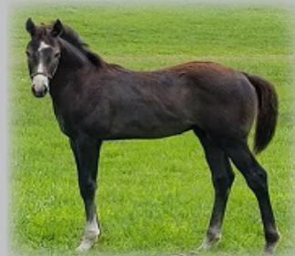
Dublin's Way by Double Irish - Misstheawayshemoves Foaled: 2/25/21 Strickland Breedings & Racing, breeder