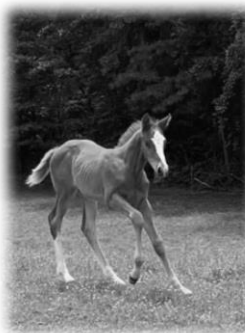
'21 colt out of Joni Gail

TANIA ($92,800) winner of the MA Stallion S., 2 nd Louise Kimball S.