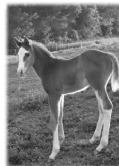
'21 filly out of Tricky Creed