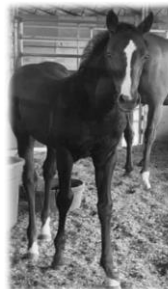
'20 filly out of Glitter Rox