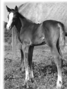
'21 colt out of Baby Sugar