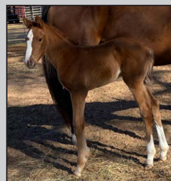
Filly by Maximum Security - Quality to Excel Kevin Applegate, breeder Foaled at McDowell Farm