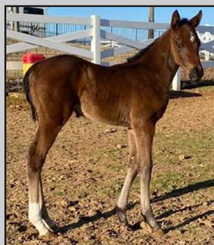
Colt by Vekoma - Pretoria Artemis Equine, breeder Foaled at Cedar Run Farm