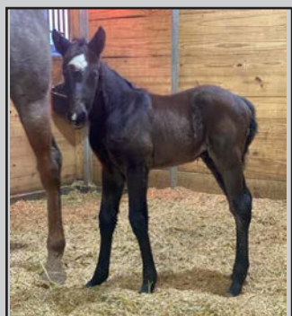
Filly by Echo Town - Indigo Blue Southern Springs Stables, breeder Foaled at Cedar Run Farm