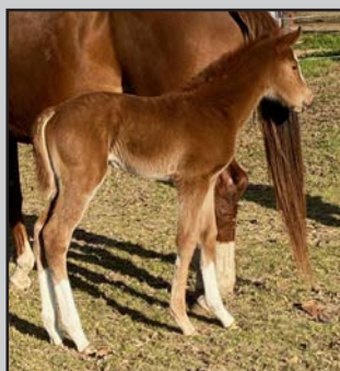
Filly by Complexity - Afillyation McDowell Farm, breeder Foaled at McDowell Farm