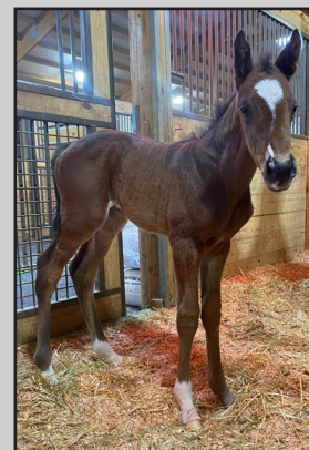
Colt by High Power - Fast Find Jerry Caroom, breeder Foaled at Cedar Run Farm