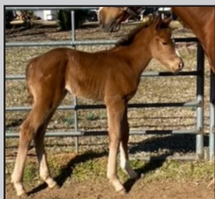
Filly by Breaking Lucky - Anea Dex Comardelle, breeder Foaled at McDowell Farm