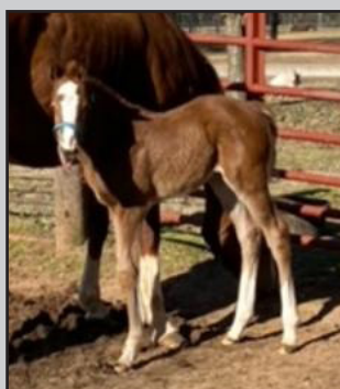
Filly by Spun to Run - Steel Cut Glen Puryear, breeder Foaled at Cedar Run Farm