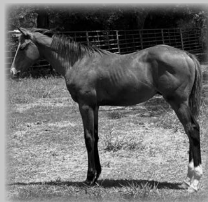
Hard Spun - Richwood Colt foaled at McDowell Farm Shortleaf Stable, breeder