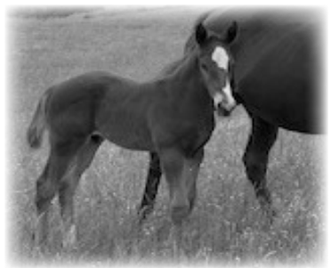
Catalina Cruiser - Finial Colt McDowell Farm, breeder