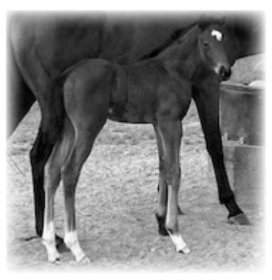
Mo Town - Sarasota Sunrise filly McDowell Farm, breeder