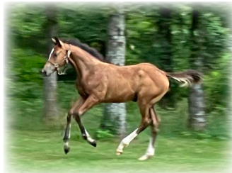
Balandeen - Sennockian Storm colt Starfish Stables, breeder