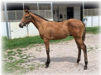
Balandeen - Wreath colt Starfish Stables, breeder