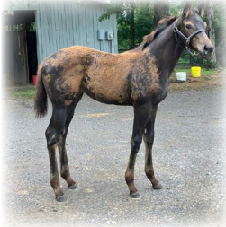
Ordained - Sunset Bonnet filly Starfish Stables, breeder