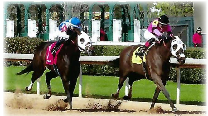
FROSTED GRACE Grade 3 $756,662