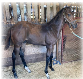
El Deal - Unholy Night colt Kirk McDowell, breeder