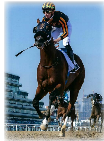
ISOLATE Grade 2 $987,015

J.W. Clement, DVM 731 Old Bear Road - Royal, AR (501) 767-1885 (501) 622-7899 lhequine@gmail.com