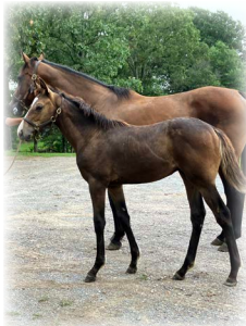
Brody's Cause - Heated Debate colt Starfish Stables, breeder