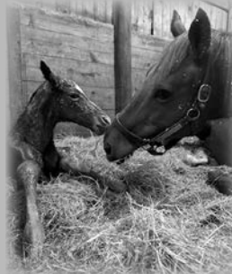
Baby meets Mommy! 1st reported foal 1/23/24