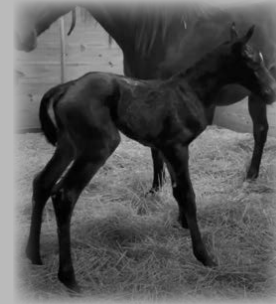
First baby steps! 2nd reported foal 1/26/24

by Tapiture - Mykindasaint filly Dash Goff, breeder foaled at McDowell Farm